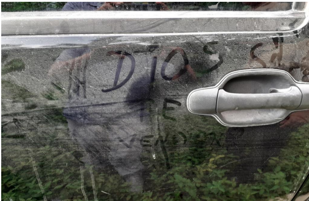
A Few Days ago, I finished my lesson in a classroom and went out to my dusty truck. A child had written "God Bless You!!!"

Quiche, Solola, Chimaltenango and Totonicapan are states that still have predominantly Mayan practices. It is so great to see how God is working in the children within these states. The joy, happiness and their eagerness to learn the the Bible stories, makes us sing praises to the Lord!